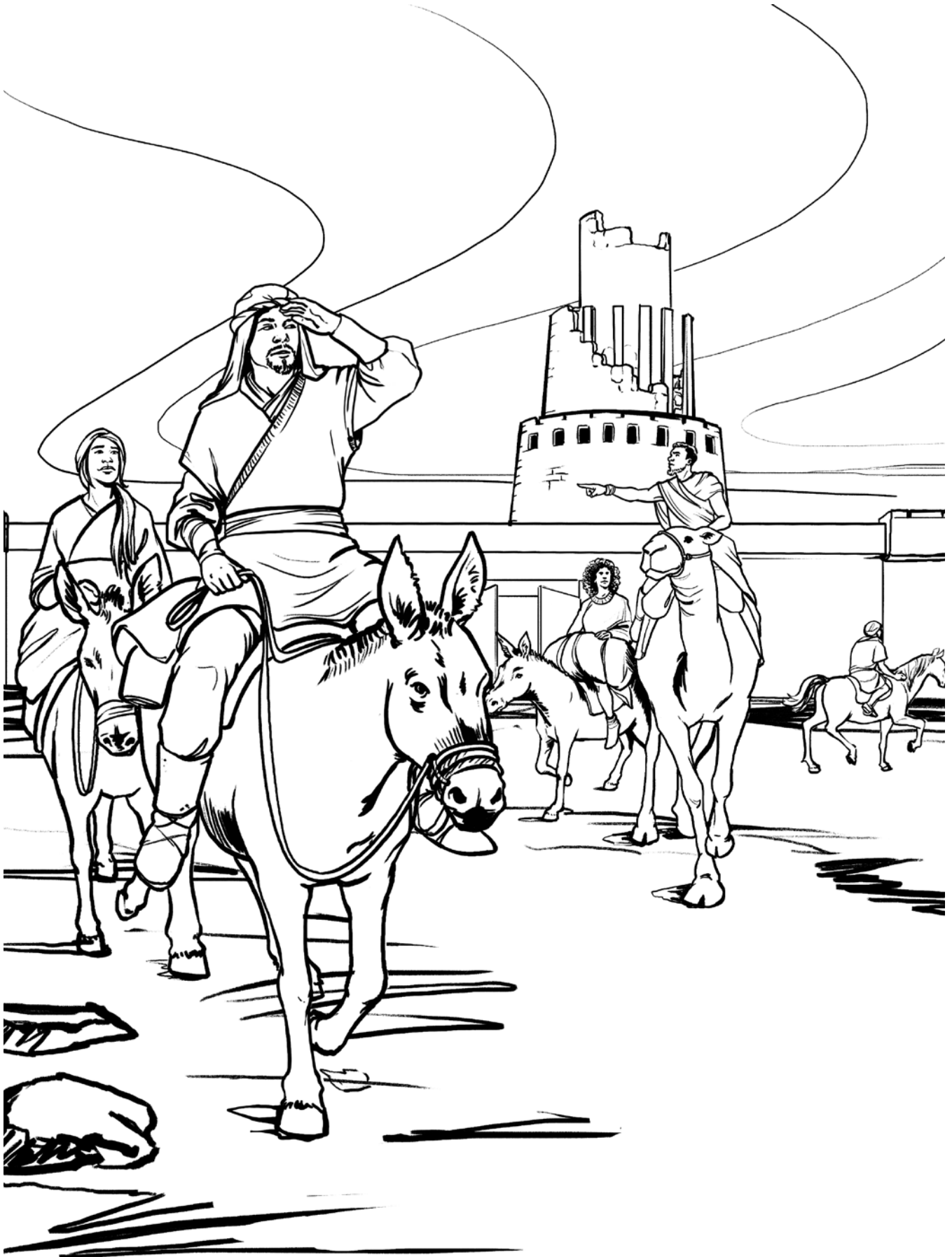
People scatter after God confuses the languages.