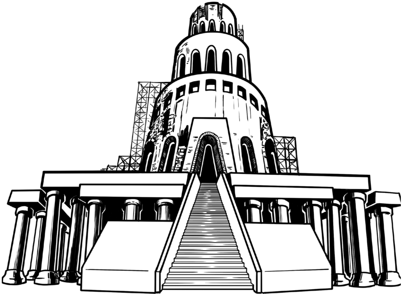
The tower of Babel