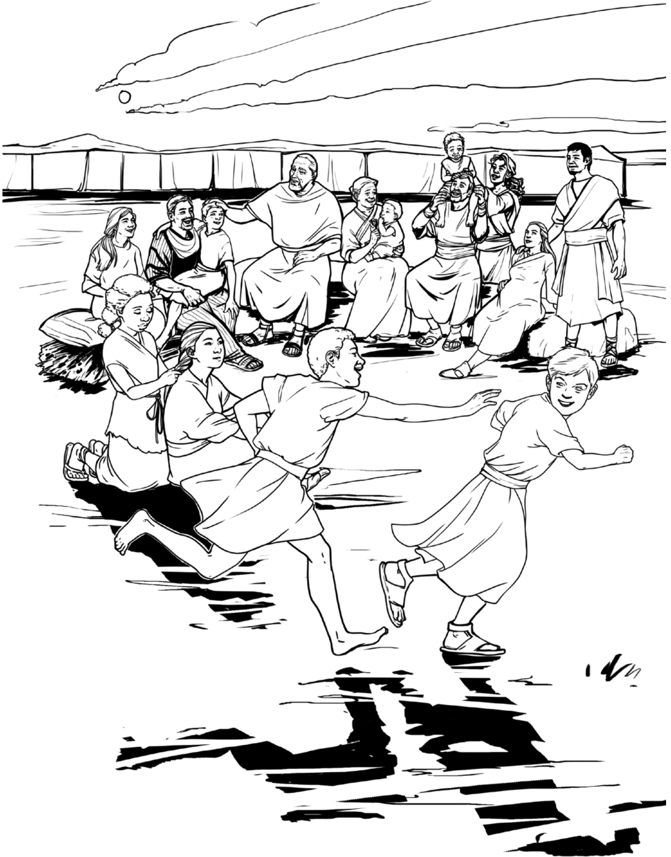
Noah teaches his sons and grandchildren.