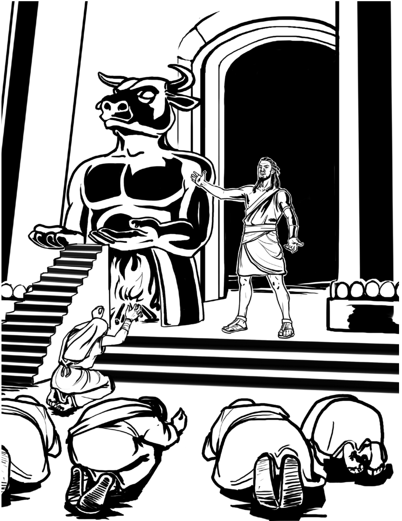
Nimrod leads people to worship idols.