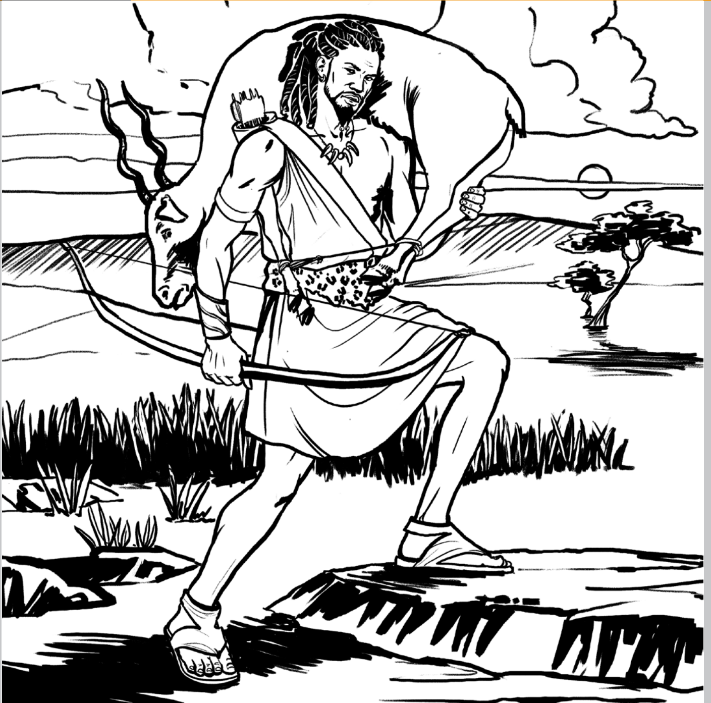
The Tower of Babel