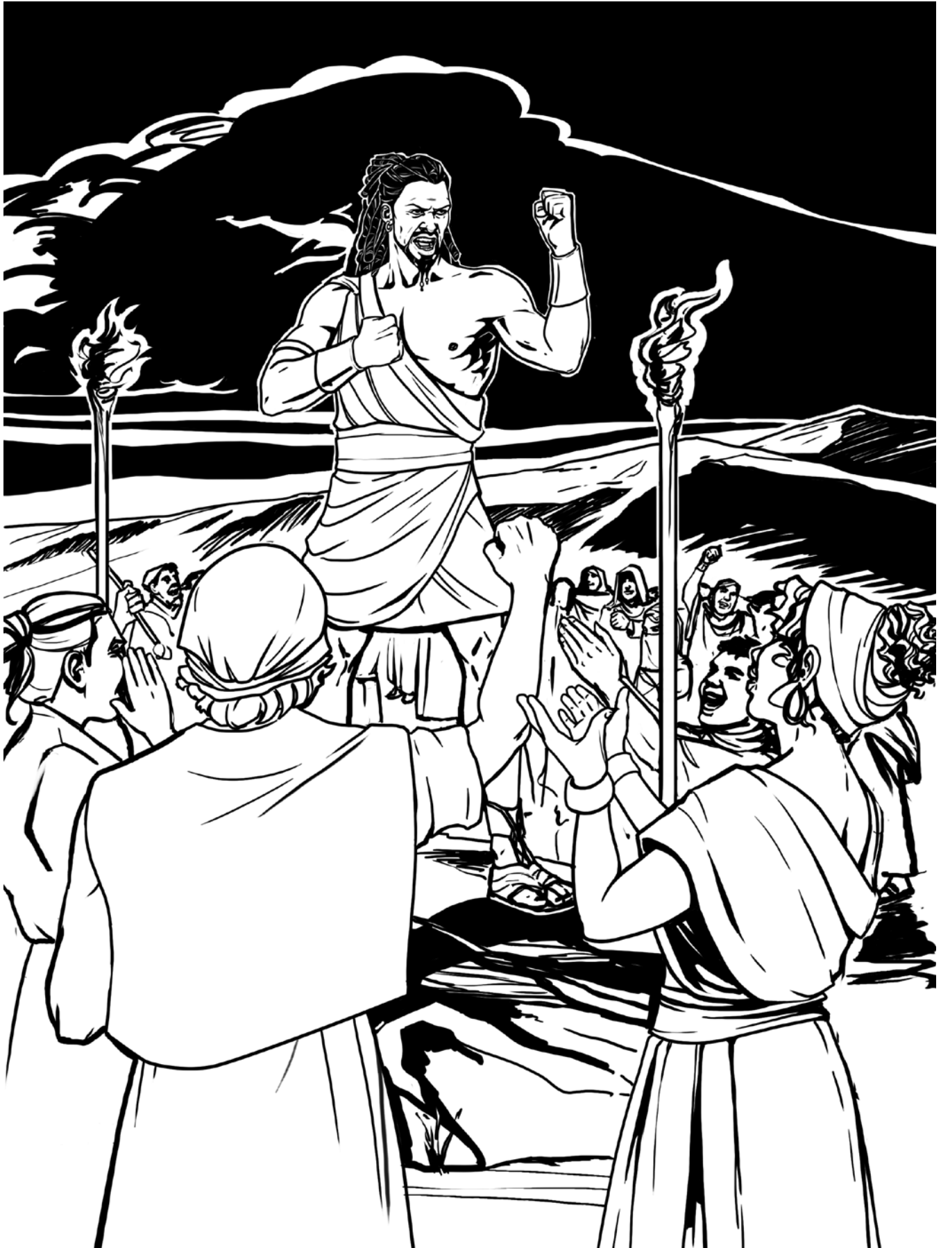
People flock to Nimrod for protection.