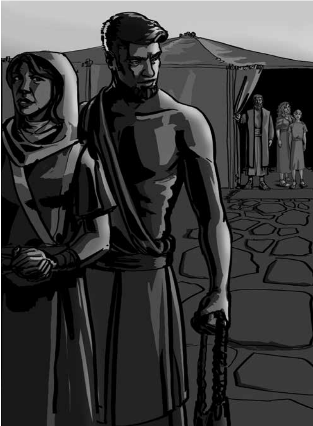
Eventually tension in the family escalates to the point that Abraham is forced to send Hagar and Ishmael away.

was 90. God spoke to Abram once again. He reminded Abram of the covenant that He had made with him and promised even more greatness. God said that he would be not just a father of one nation but “a father of many nations.” He also said that Sarai would be a “mother of nations” and the descendants of Abram and Sarai would include many kings (Genesis 17:4, 16). God said that this covenant would be everlasting! He promised to always be with Abram and all his generations. God also once again made it clear that these promises would be fulfilled through a son born to Sarai and no other woman.