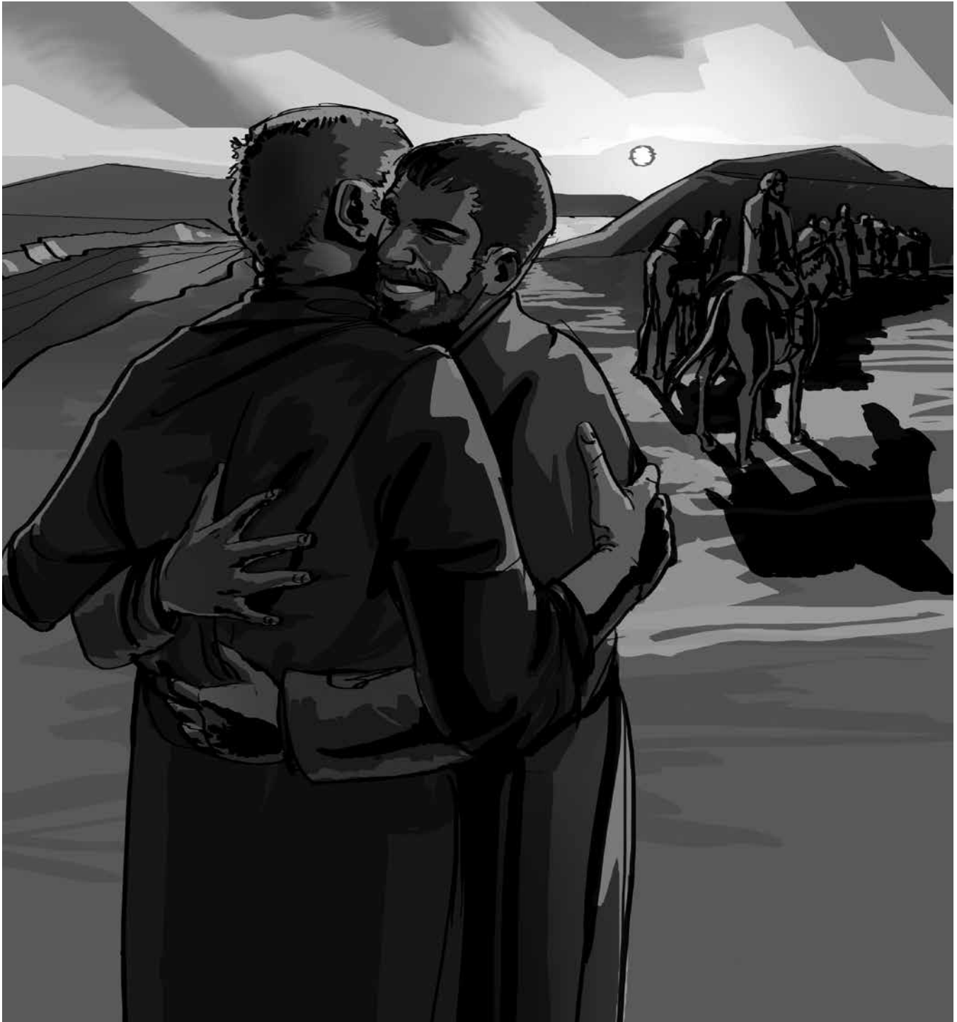
Abram and Lot part ways.

God appeared to Abram and reminded him of the promise. He reassured him that his heir would be his own flesh-and-blood child, not one of his servants. God then said that Abram's descendants would be as innumerable as the stars in the sky. Ac-